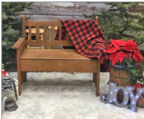
Approximate Poinsettias Sizes 6.5" pot: 14 - 16" tall and 13 - 16" wide